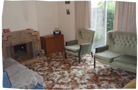
One of the living areas ▲